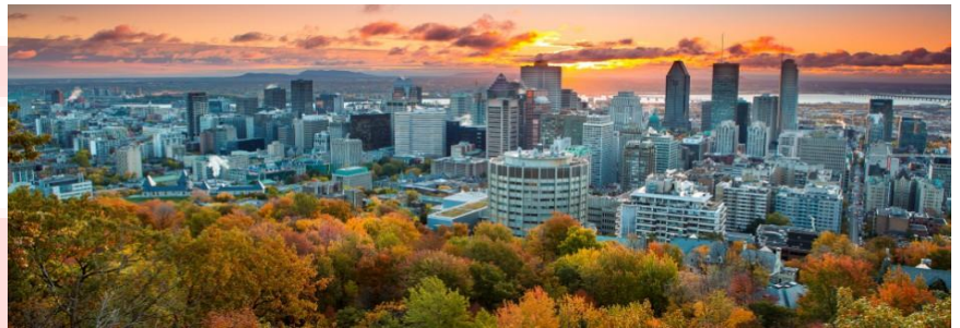
Montreal City Skyline: view from the top of Mount Royal

Conference Breakdown: This one's a no-brainer – after all, CPA provides a unique opportunity to connect with colleagues from across the country. This year's program promises to be a great, including a keynote address by Dr. Steven Pinker!