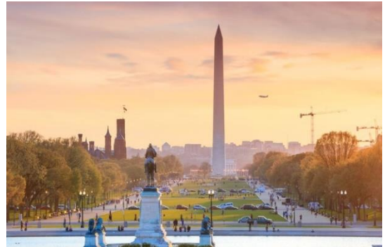
The Washington Monument

Conference Breakdown: The APA convention is much more general than the other conferences on this list, but will still feature a large health psychology division. In terms of attendance, guests can expect this to be one of the larger conferences on our list. There is still time to get your abstract in, so be sure to take advantage of this opportunity if you have missed out on the others!