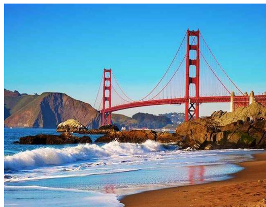
The Goldengate Bridge in San Francisco